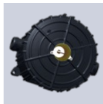
Junction box ELAK-R