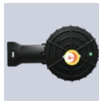
Junction box EX- it-R

Learn more about this product: https://www.ebeco.com/products/industry/pt-100-sensor