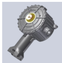
Junction box ELAK-RS