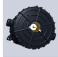
Junction box ELAK-R