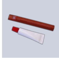
Termination kit EL-EC SH-ex