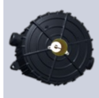
Junction box ELAK-Ex-R

Learn more about this product: https://www.ebeco.com/products/industry/elsr-shh