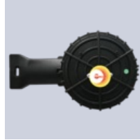
Junction box EX- it-R