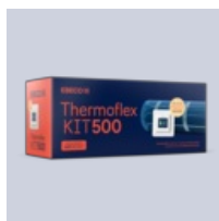
Thermoflex Kit 500