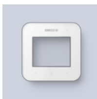
Front cover EB- Therm 500

Learn more about this product: https://www.ebeco.com/products/control/eb-therm-500