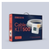
Cable Kit 500