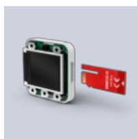
EB-Connect wM- Bus