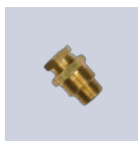
Supplementary kit F-10