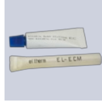
Termination kit EL-ECM

Learn more about this product: https://www.ebeco.com/products/industry/el-sr-r