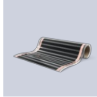
Foil 230 V