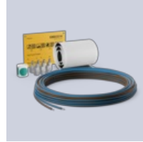
Connection Kit Foil