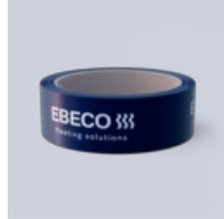
Fixing tape foil