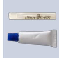
Termination kit EL-ECP2