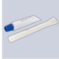
Termination kit EL-ECP2