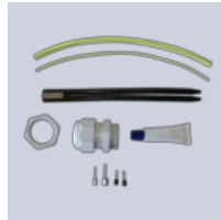
Connection kit ELBV-SRA-25