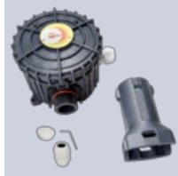
Junction box ELAK-RS

Learn more about this product: https://www.ebeco.com/en/products/industry/elsr-n-halogen-free