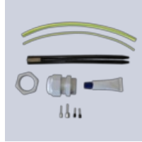
Connection kit ELBV-SRA-25