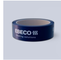
Fixing tape foil