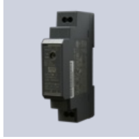
Transformer 24 VDC